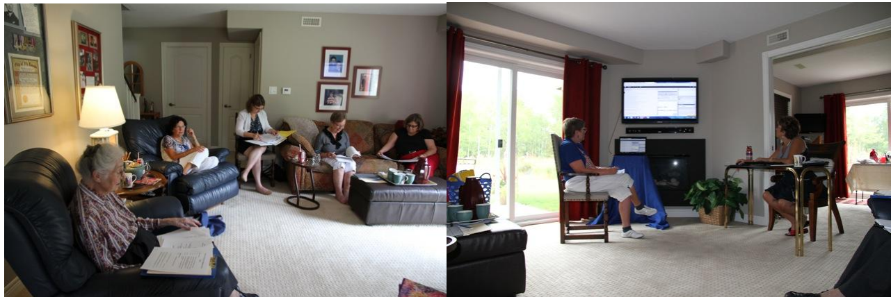
Virtual Meeting connects BPW Members across Canada.

The Biennial Convention experience will never be replaced by a Virtual meeting because the personal spirit of camaraderie of convention experience can never be replaced!!