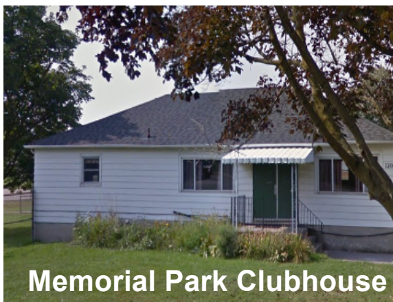
Memorial Park Clubhouse