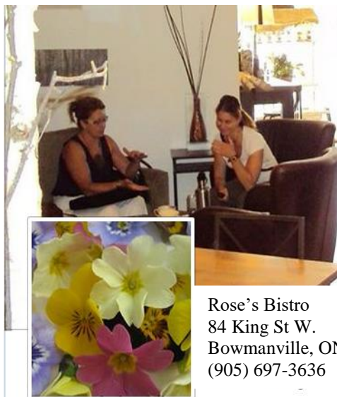
Rose's Bistro 84 King St W. Bowmanville, ON (905) 697-3636