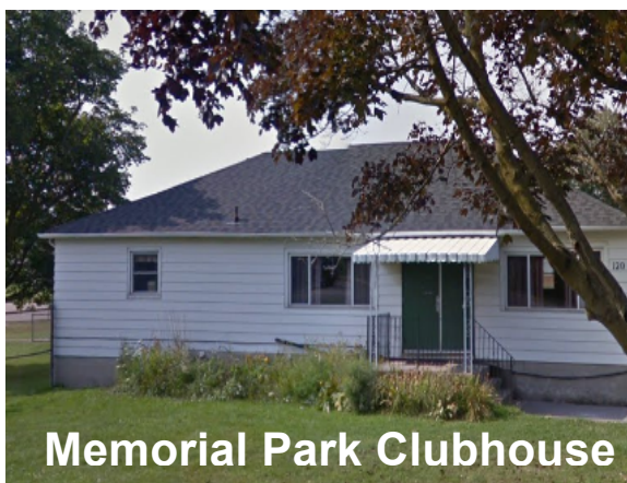
Memorial Park Clubhouse