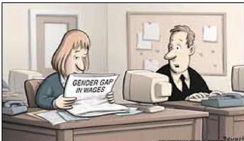
"Three-fourths of a penny for your thoughts."